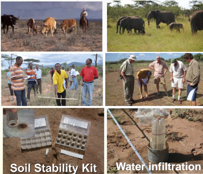
Soil Stability Kit

Simple vegetation composition + structure methods for livestock, wildlife & biodiversity conservation